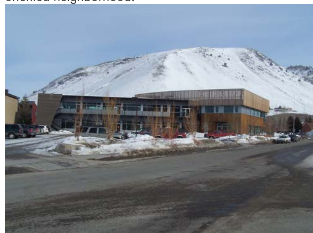
“7/10 Split” Building, 1110 Maple Way

vehicular and pedestrian connections, including the Maple Way and Snow King redesign, are necessary. Such improvements will improve traffic flow, break up the existing large blocks, and create a more pedestrian-oriented neighborhood.